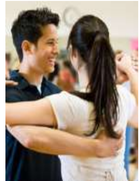
Ballroom, Latin, Swing, Nightclub & Country Dance Classes --& Parties.